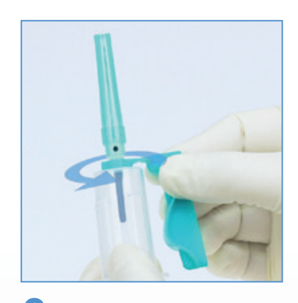
2 If desired, re-position safety shield