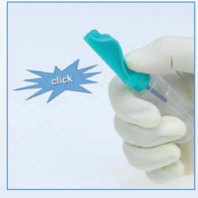
8 Audible click indicates activation