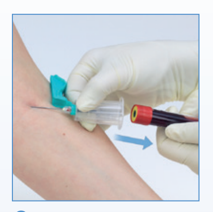
6 Remove the tube